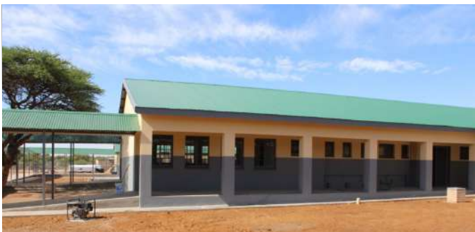
Tselaathuto Middle School