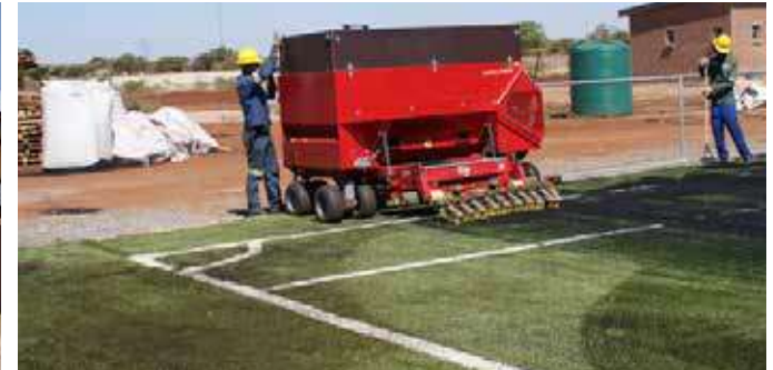
Mantserre Sport Centre