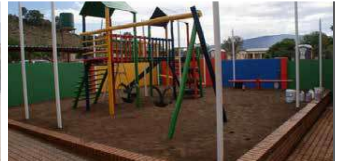
Mpetje Primary School