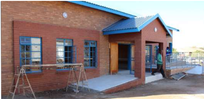
Ramasedi Community Hall