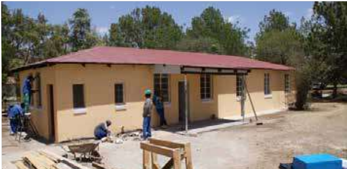
Karee Base Project