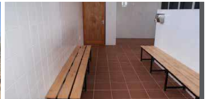
Mantserre Sport Centre